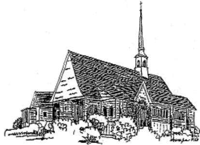
All Saints' Church, Rehoboth Beach

How do you experience the Spirit of God in your life? For many, the Holy Spirit comforts us with a sense of God's abiding pres-