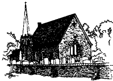
St. George's Chapel, Harbeson

ence, trusting that we are not abandoned, that we do not walk alone. Others find courage as a gift of the Holy Spirit to attempt tasks in service to God and God's people that they would have never believed possible.