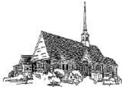
All Saints' Church, Rehoboth Beach