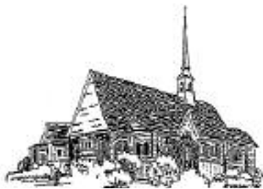
All Saints' Church, Rehoboth Beach