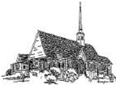
All Saints' Church, Rehoboth Beach

You bid your faithful people cleanse their hearts, and prepare with joy for the Paschal (Easter) feast; that, fervent in prayer and in works of mercy, and renewed by your Word and Sacraments, they may come to the fullness of grace which you have prepared for those who love you.